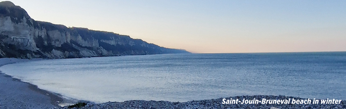
Saint-Jouin-Bruneval beach in winter