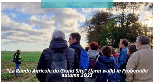
"La Rando Agricole du Grand Site" (farm walk) in Froberville autumn 2023

The Grand Site is particularly visited. Faced with this influx, an action program has been developed by the partners to protect the landscapes, organize travel and promote immersion for visitors. It was validated in 2019 by the Ministry of Ecological Transition.